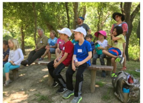
Birds and their Amazing Adaptations